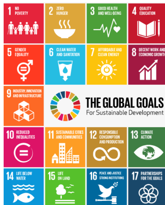
Figure 1. Sustainable Development Goals

which included a set of 17 Sustainable Development Goals (SDGs). The SDGs consists of 3 systems with 17 Economic system goals such as: (1) No Poverty, (2) Zero Hunger, (3) Good Health and Well Being, (6) Clean Water and Sanitation, (7) Affordable and Clean Energy, (8) Good Jobs and Economic Growth, (9) Industry, Innovation and Infrastructure; Environmental System, such as: (11) Sustainable Cities and Communities, (12) Responsible Consumption and Production, (13) Climate Action. (14) Life Below Water, (15) Life on Land; Social System, such as: (4) Quality Education, (5) Gender Equality, (10) Reduced Inequalities, (16) Peace, Justice and Strong Institutions, (17) Partnership for the Goals (United Nations, 2015). The 17 goals of the sustainable development are the outlines to achieve a better life in the world encompassing economic, social and environmental dimensions. This is the agenda of United Nation that should be attained in 2030.